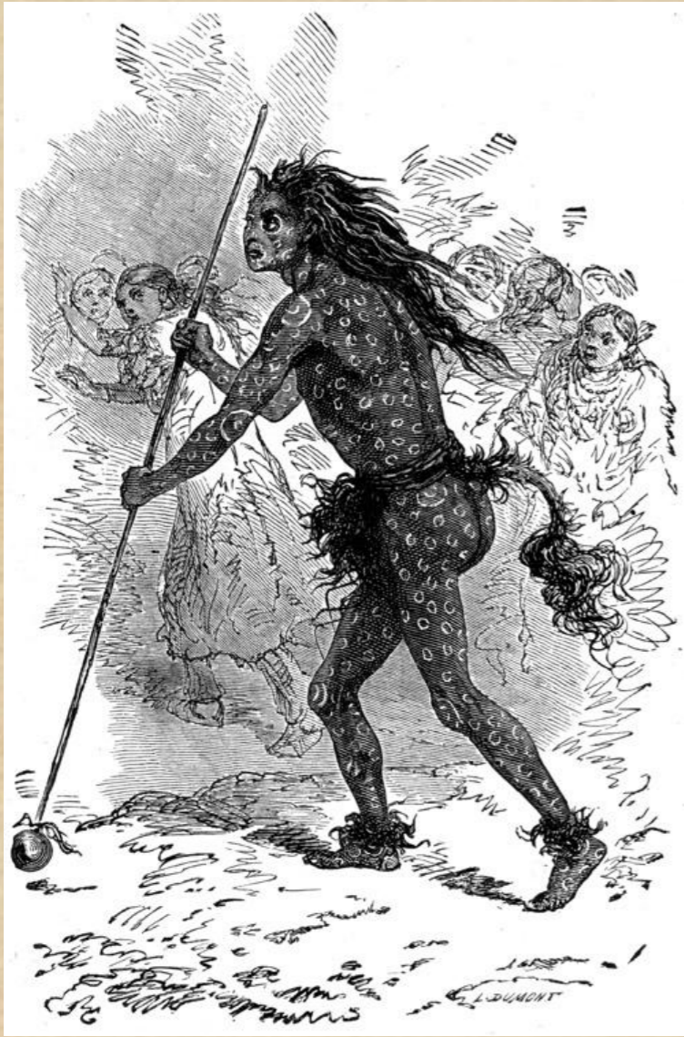
Algonquin Medicine Man