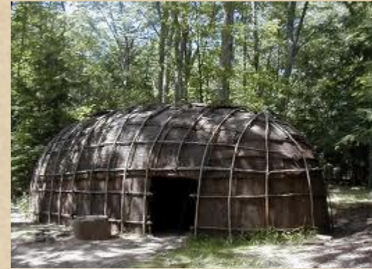
Algonquin style wigwam