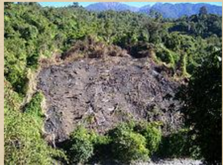
Effects of Slash and Burn farming techniques