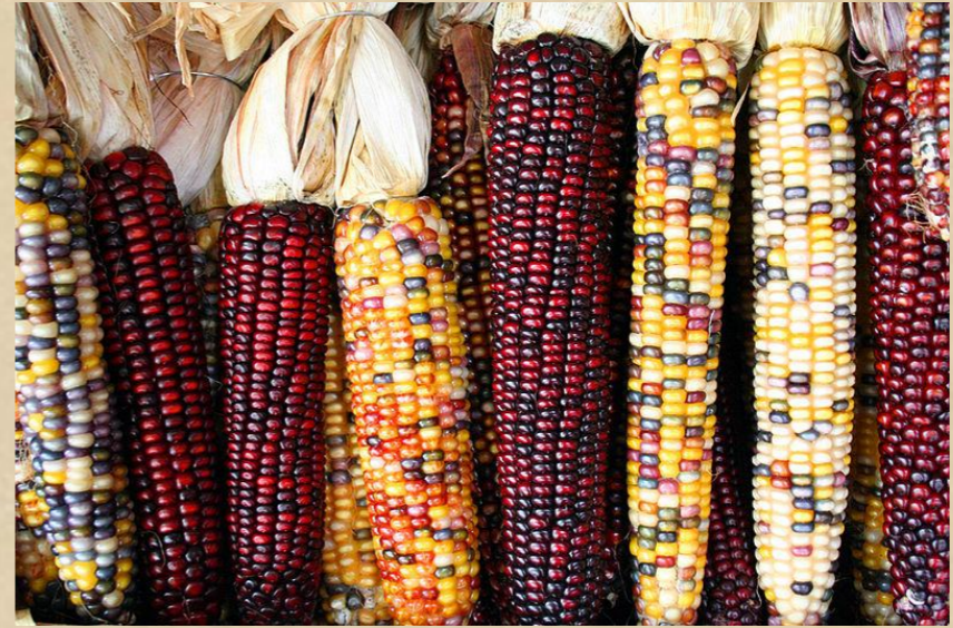
Various corn ears